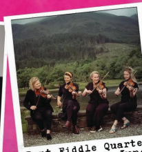
Rant Fiddle Quartet Friday 30th June