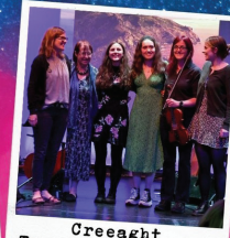
Creeaght Tuesday 27th June