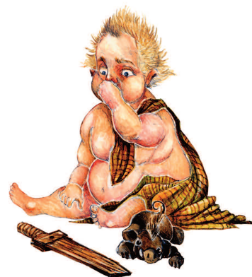
The young Earl of Moray