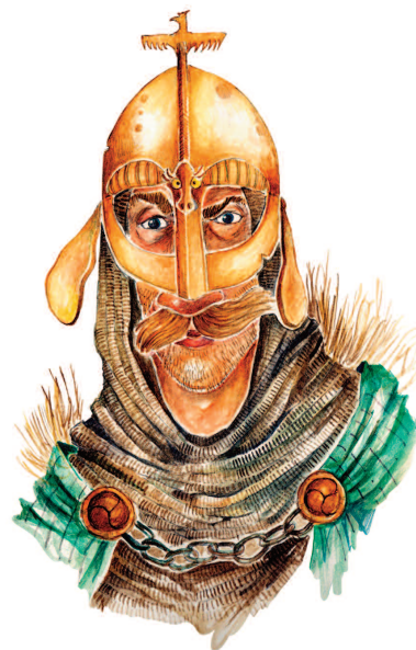
King Hakon of Norway