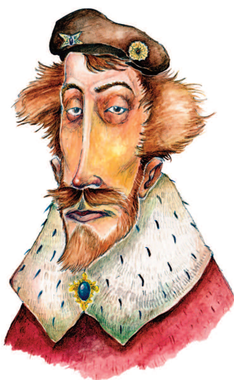
Alexander III of Scotland