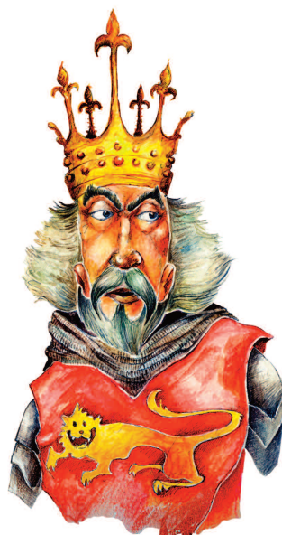
Edward III of England