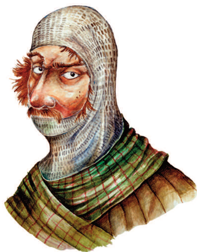
Robert the Bruce