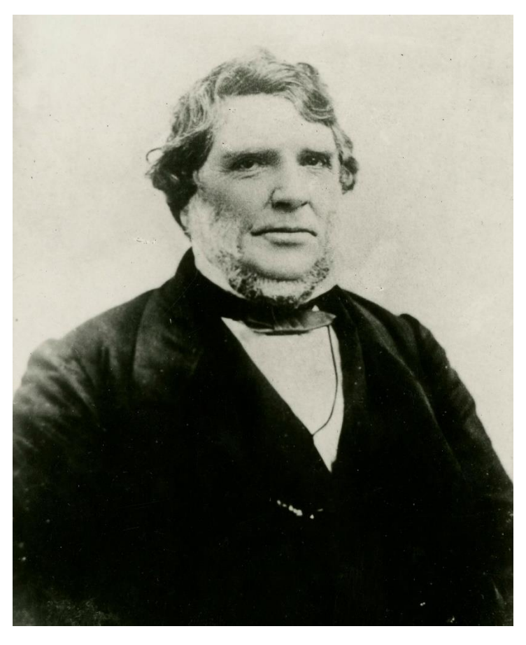
William Kennish